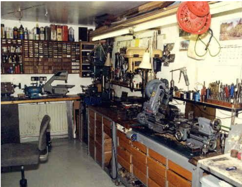
A typical model engineer's workshop.