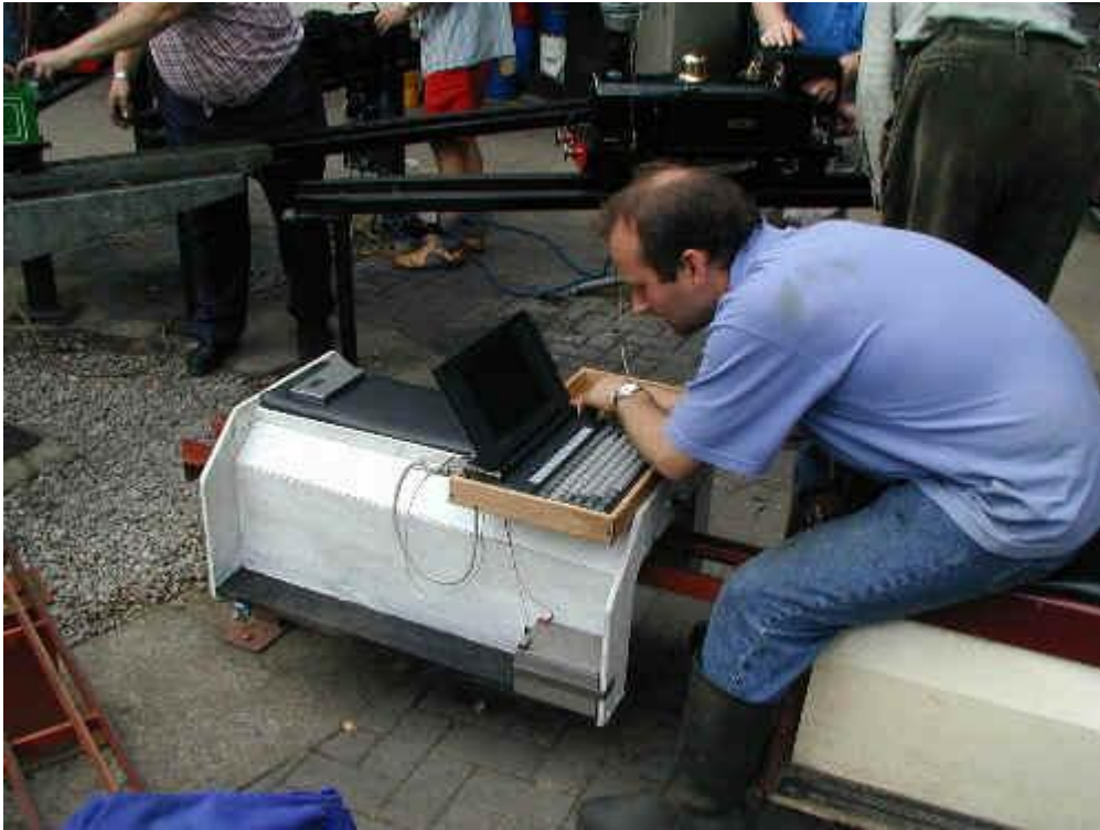
Experimental devices. This is a miniature dynamometer car utilizing a laptop computer and some tricky electronics. It measures the performance of the locomotive.