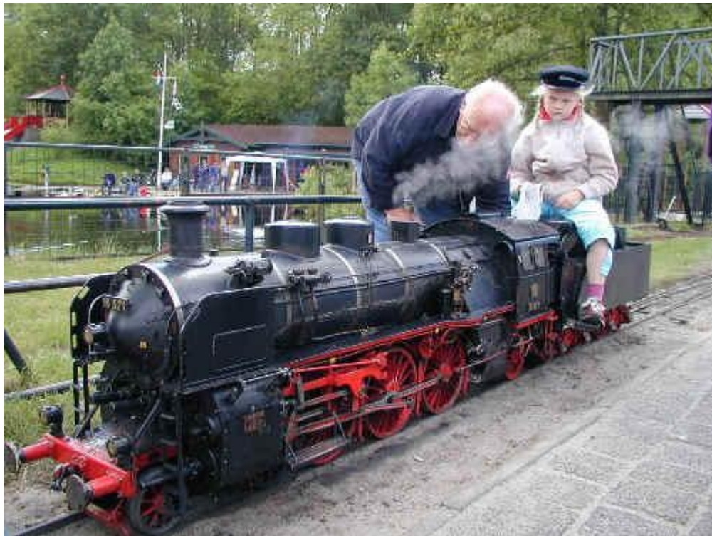
Big locomotives, a German engine for 203mm gauge.