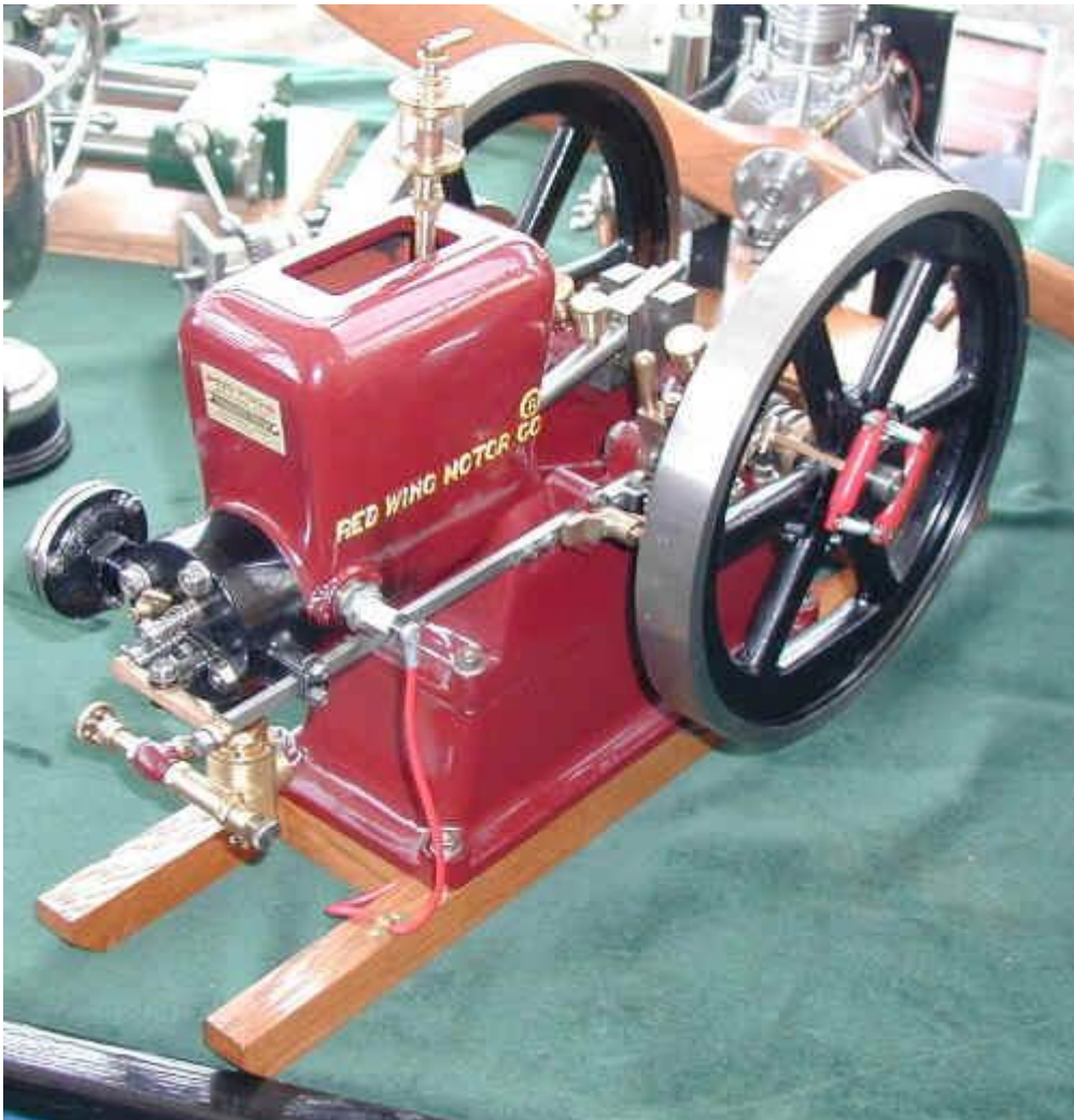
Barn engines, used by farmers years ago, and now much in evidence at steam fairs as restored full size engines.