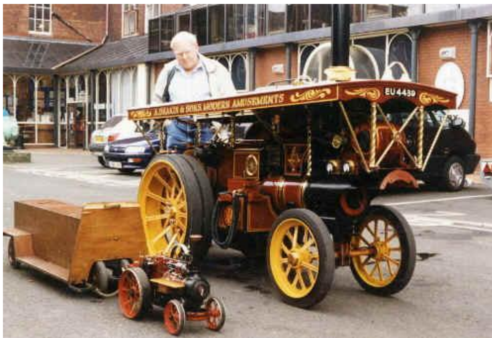
Traction engines little and large, a 1½" Allchin alongside a 4½" Burrell showman's engine.