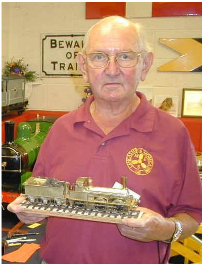
Little locomotives, this is an LSWR Ilfracombe Goods engine in '0' gauge hand made in nickel silver.