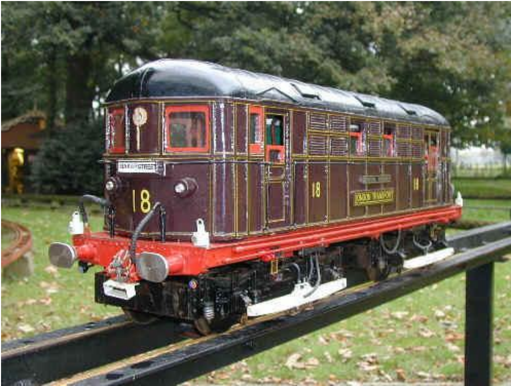
Old locomotives, this is a London Transport electric 'Growler'.