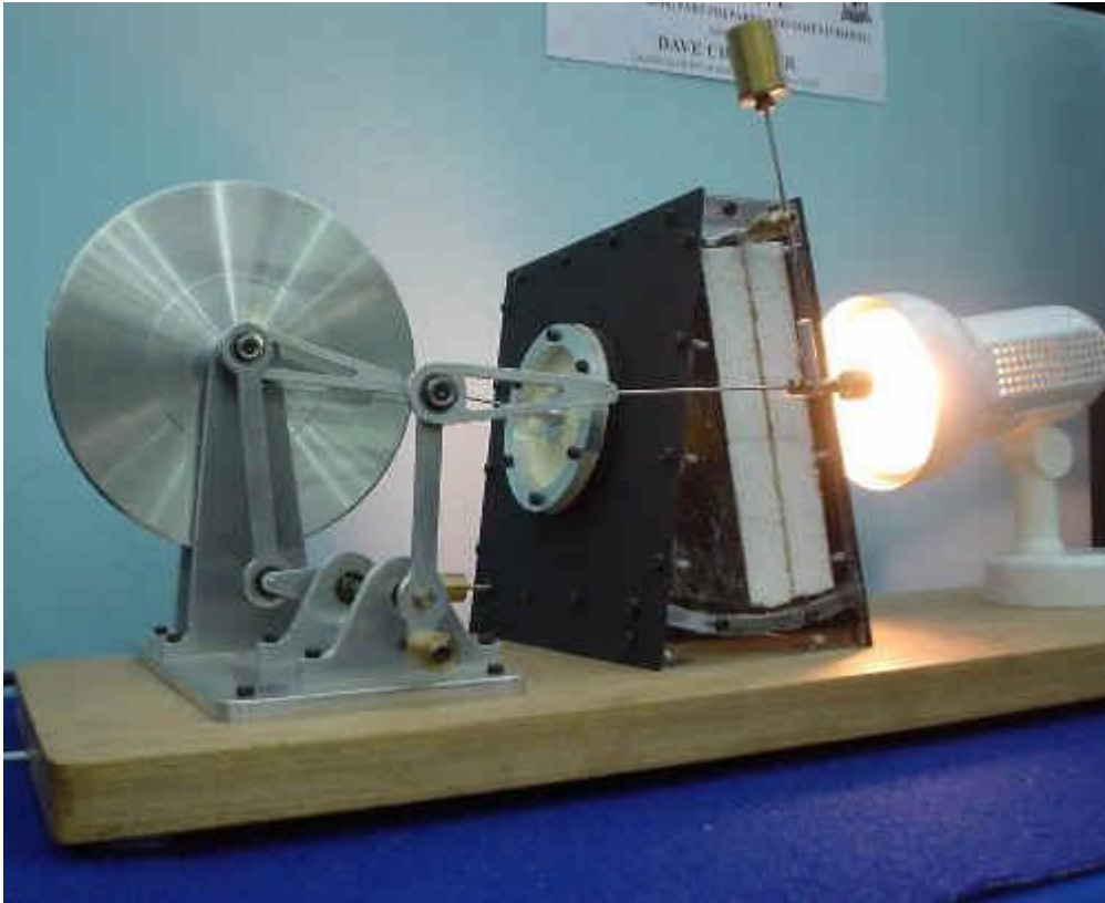
Hot air engines, working on the Stirling Cycle and presently enjoying a revival of interest; a good subject for experimentation.