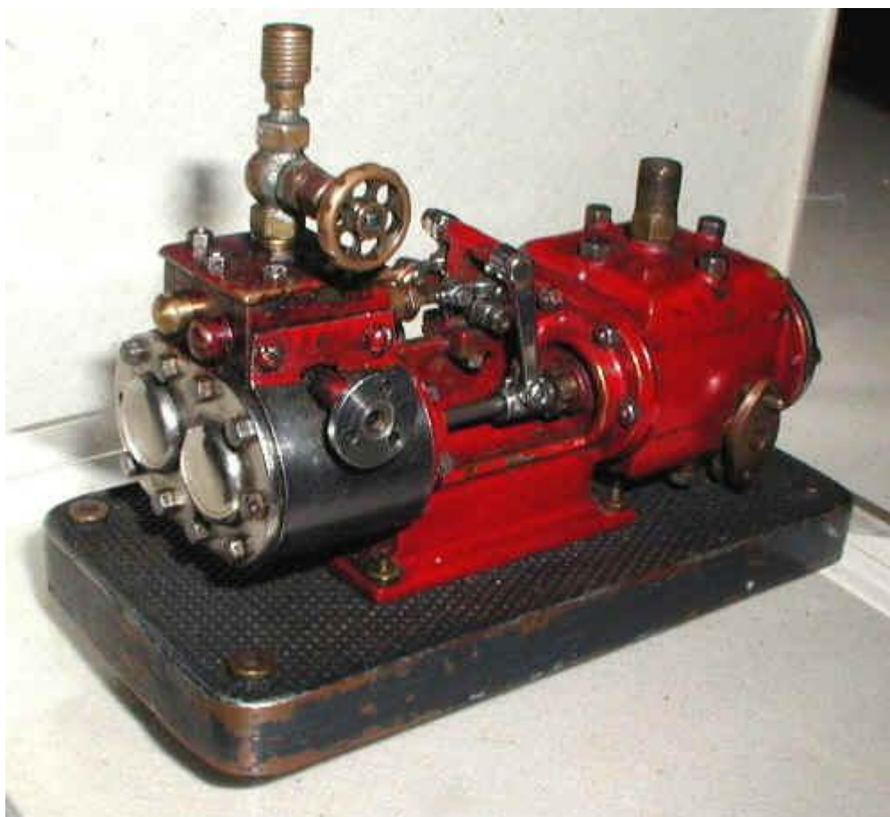
Pumps of every kind, this is a duplex donkey pump for injecting water into a stationary boiler.