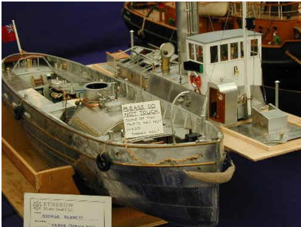
Boats with an engineering content. This one is made from old aluminium printing plates and is steam driven